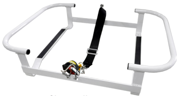
Low Profile Cradle