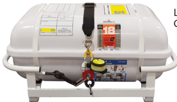
Low Profile Container